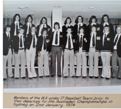
Members of the WA under-17 Baseball Team prior to their departure for the Australian Championships in Sydney on 2nd January 1974.