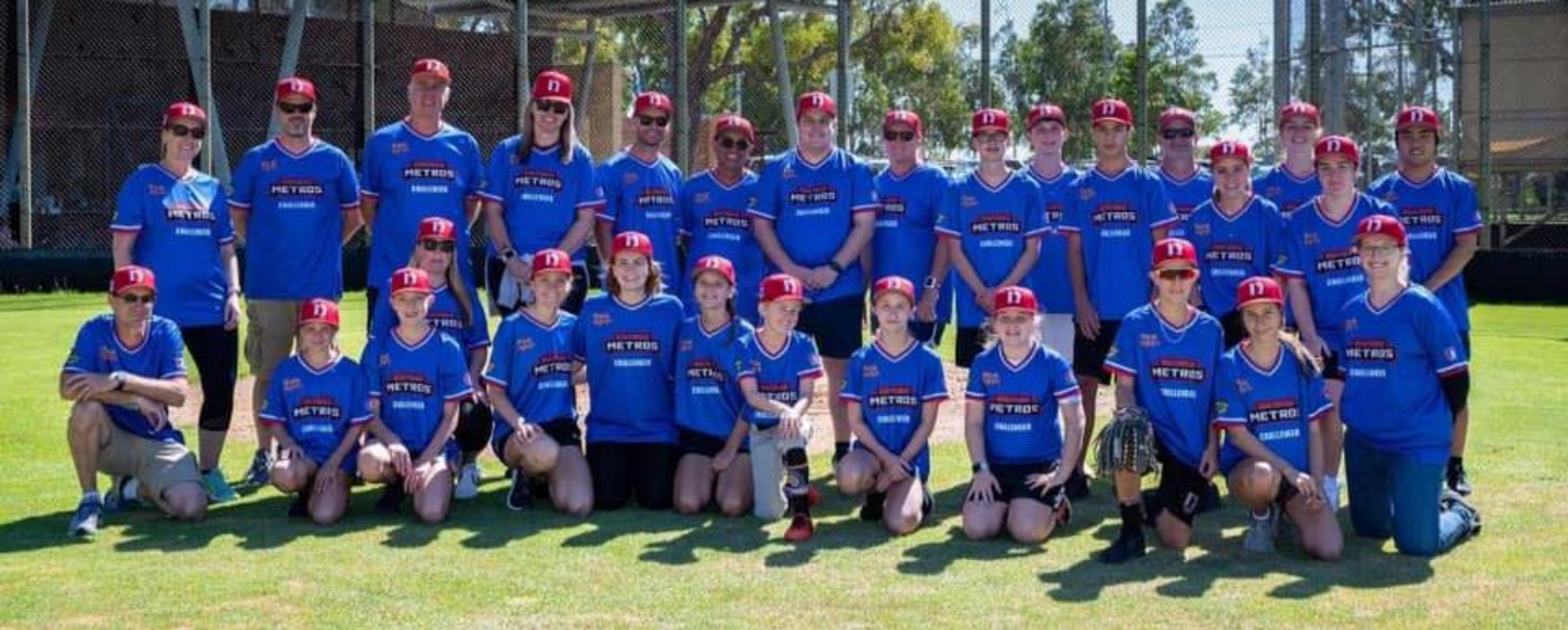
Wanneroo Giants Challenger Division